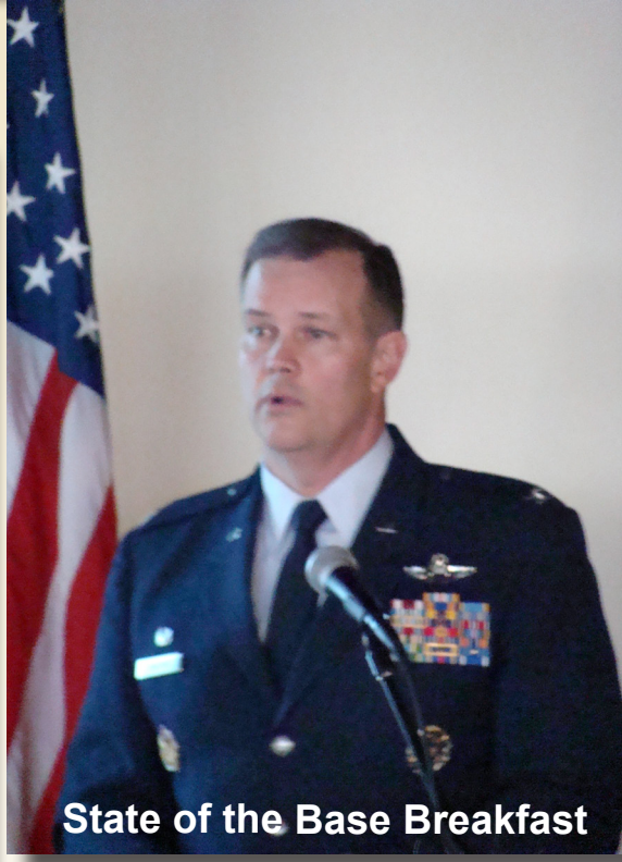
State of the Base Breakfast