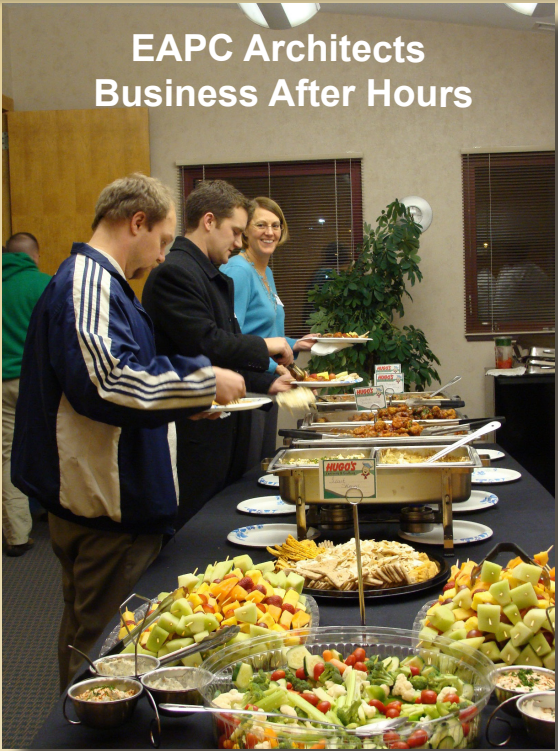
EAPC Architects Business After Hours