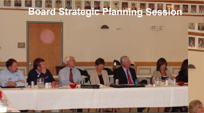
Board Strategic Planning Session