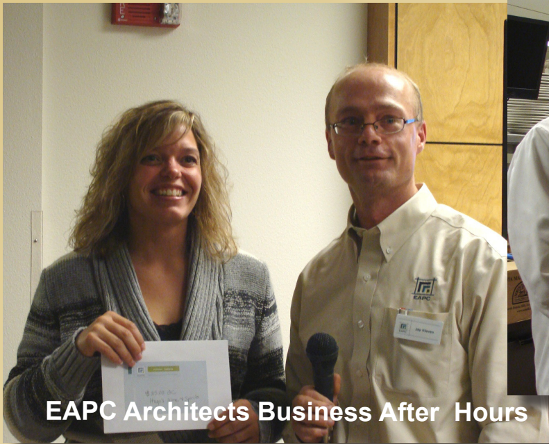
EAPC Architects Business After Hours