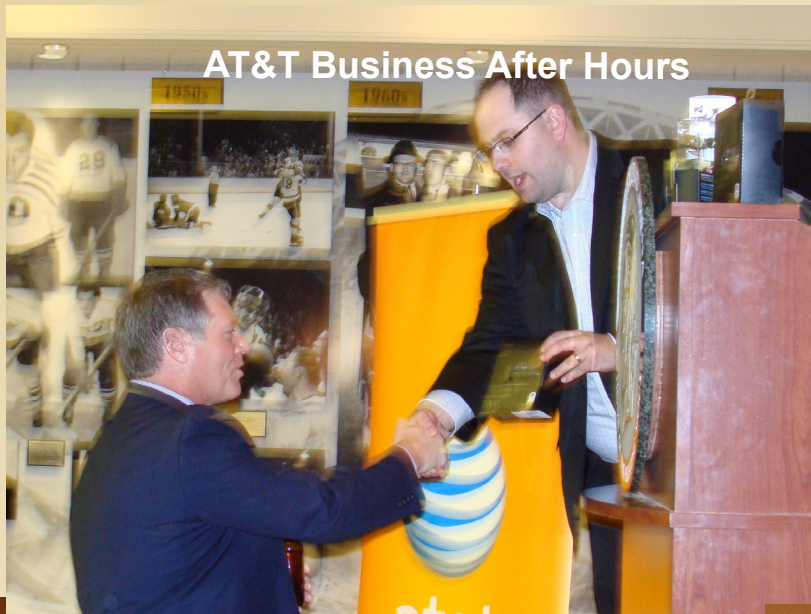
AT&T Business After Hours