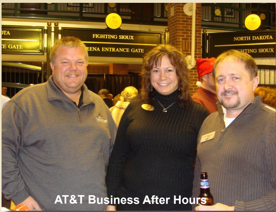
AT&T Business After Hours