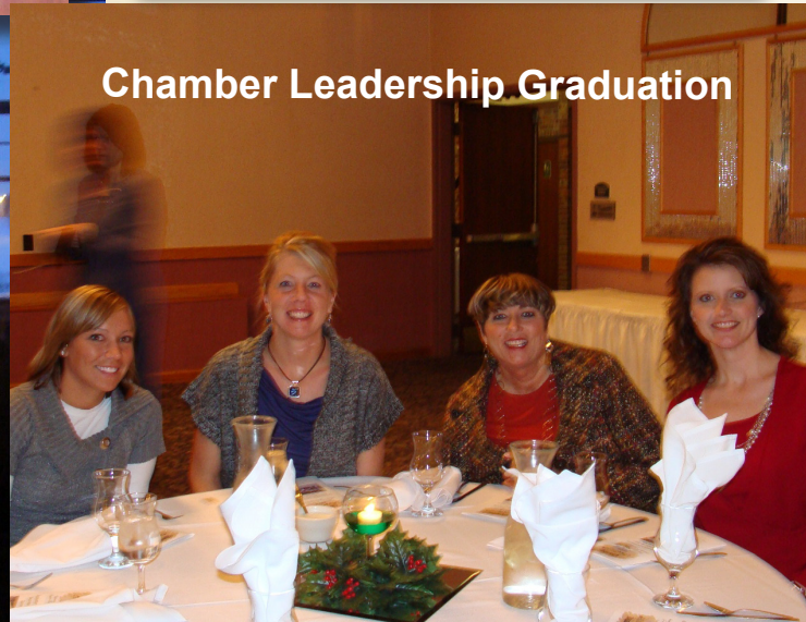
Chamber Leadership Graduation