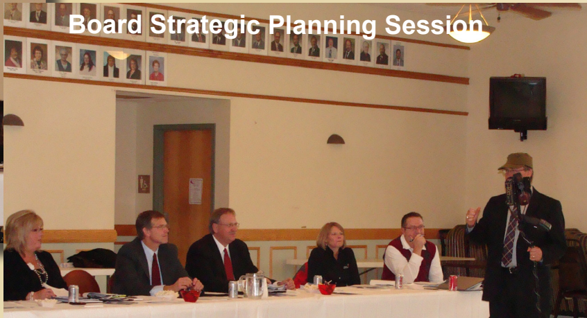
Board Strategic Planning Session