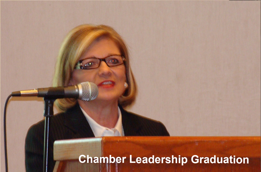
Chamber Leadership Graduation